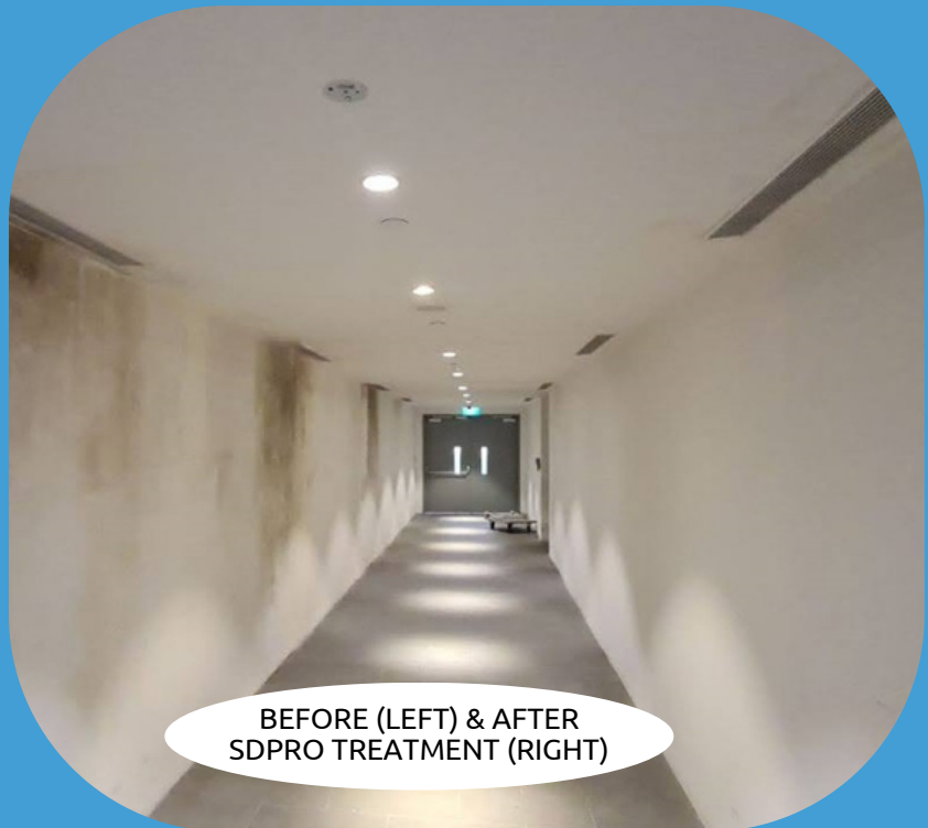
BEFORE (LEFT) & AFTER SDPRO TREATMENT (RIGHT)